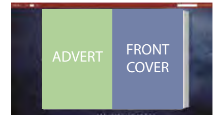
option 3 + inner cover